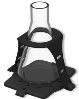
Erlenmeyer Flask Attachment (VM-D-FLtASK)