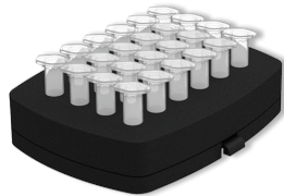
24 x 1.5 mL Microtube Attachment (VM-D-TUBE)